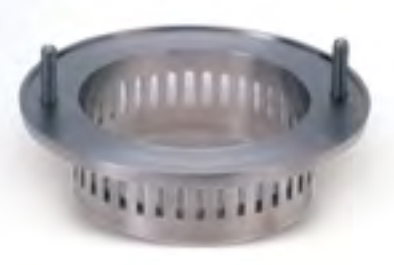
Slotted disintegrating head