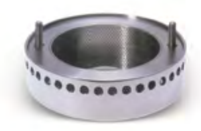
Standard emulsor head and emulsor screen